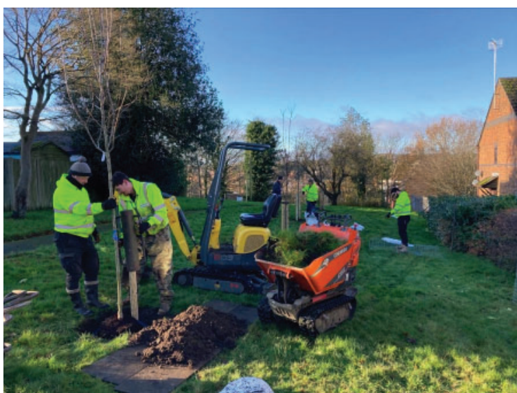
Planting at Redan Hill Gardens

Rushmoor Borough Council will continue to maintain the trees for the 3 years aftercare stipulated by the Forestry Commissions Urban Tree Challenge Fund.