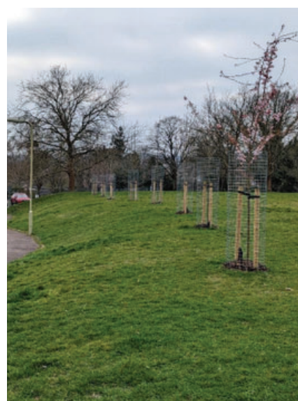
Planting at Sheridan Close