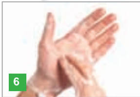
Rotational rubbing of palms; right fingers to left palm and vice-versa