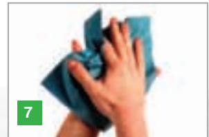
After washing, rinse hands under running water and dry thoroughly on paper towels