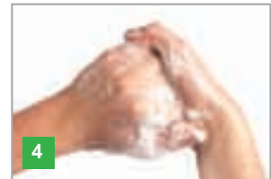
Wash with backs of fingers to opposing palms, fingers interlocked