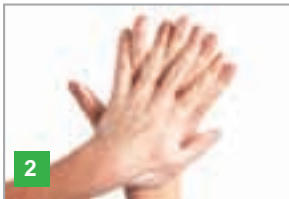
Clean between fingers; right hand over left and left over right