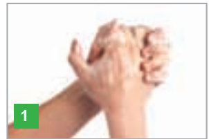
Wet hands, apply soap and lather palm to palm

Instructions on good hand washing techniques are given below: