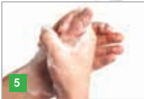
Clean left thumb with rotational movement of right hand and vice-versa