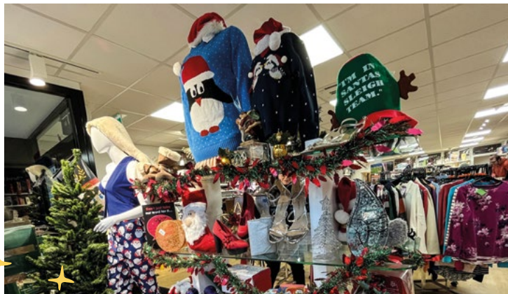
Christmas window display at the Salvation Army shop in Aldershot

With Christmas such a busy time, it can be tempting to rush through another online order or add extra items to your trolley at the supermarket, but don't forget that there are some amazing small businesses and high street shops locally that need your support.