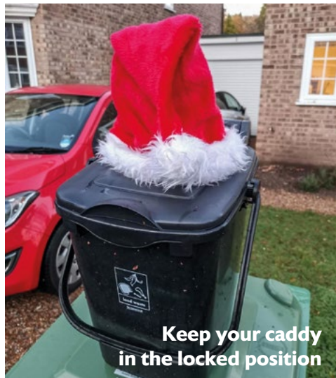
Keep your caddy in the locked position

It's been another successful year of recycling in Rushmoor with more than 2,940 tonnes of food waste collected from homes across Aldershot and Farnborough, which has been used to generate 1171 megawatt-hours of renewable energy.